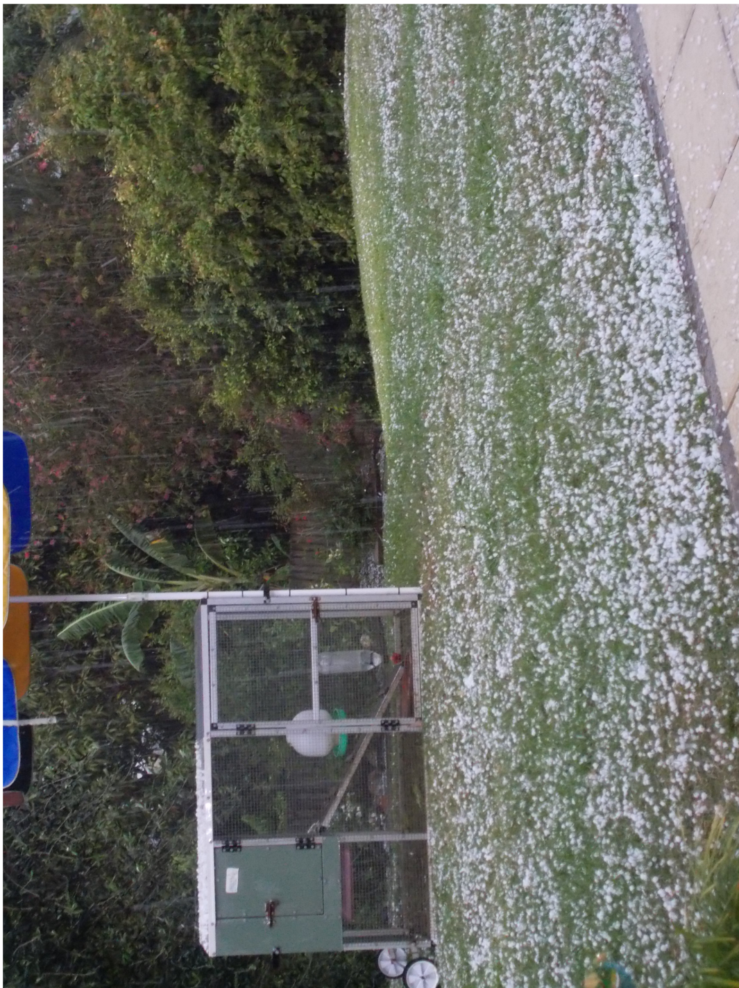
OCT 2015 - Sign of things to come this summer. Yes that is a beach umbrella on our chook pen!